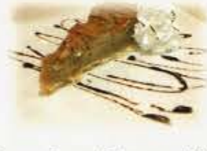
Bourbon Pecan Pie 5