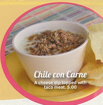
Chile con Carne A cheese dip topped with taco meat. 5.00