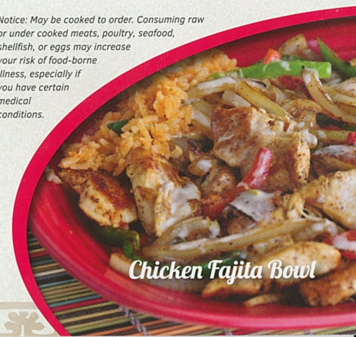
Chicken Fajita Bowl

Notice: May be cooked to order. Consuming raw or under cooked meats, poultry, seafood, shellfish, or eggs may increase your risk of food-borne illness, especially if you have certain medical conditions.